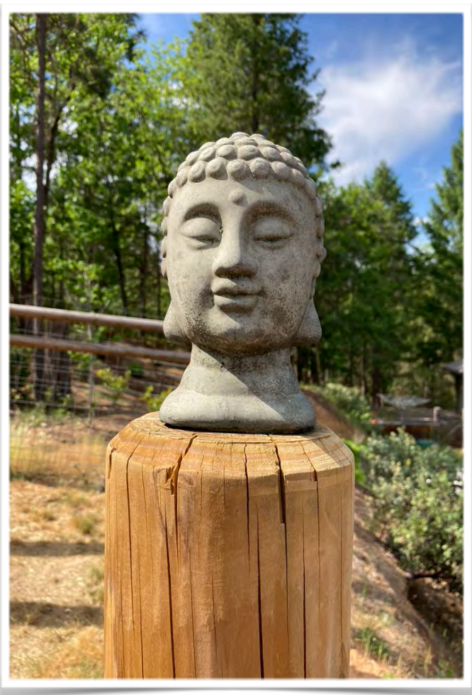
Meditation or Serenity Buddha for people seeking calm and to guide their meditation practice.

We also continued our G.I.F.T.'s and will continue to do these in the future and, when we get back on campus, we will present them at In Service again! So think about what Great Idea For Teaching you can offer.