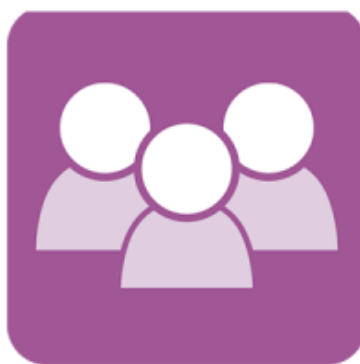
Social & Behavior Science, Education