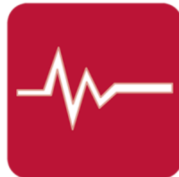
Health Professions, Public Safety