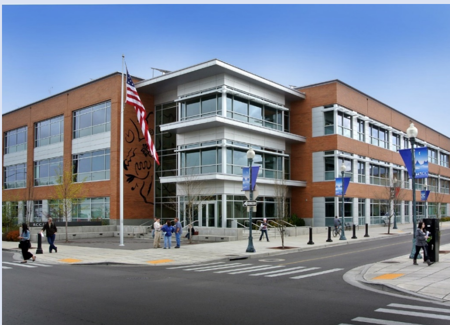
RCC/SOU Higher Education Center in Medford