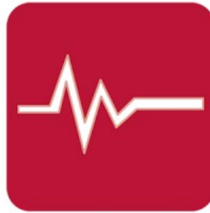
Health Professions, Public Safety