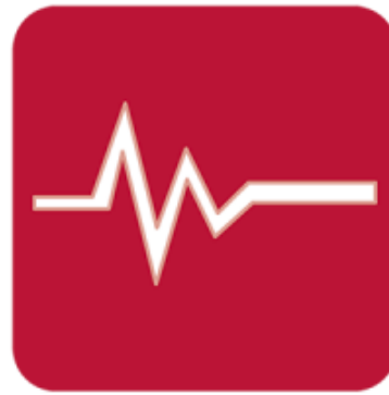
Health Professions, Public Safety