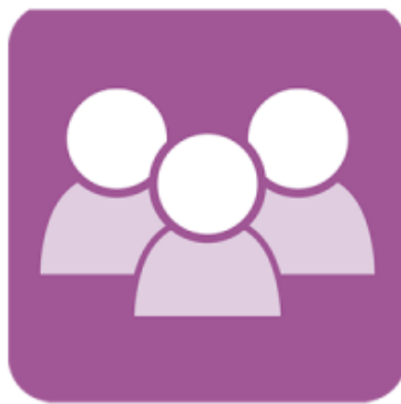
Social & Behavior Science, Education