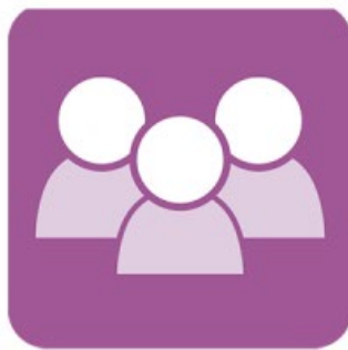
Social & Behavior Science, Education